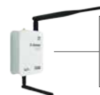
SL GATEWAY PICO